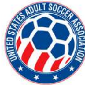
USA Adult Soccer